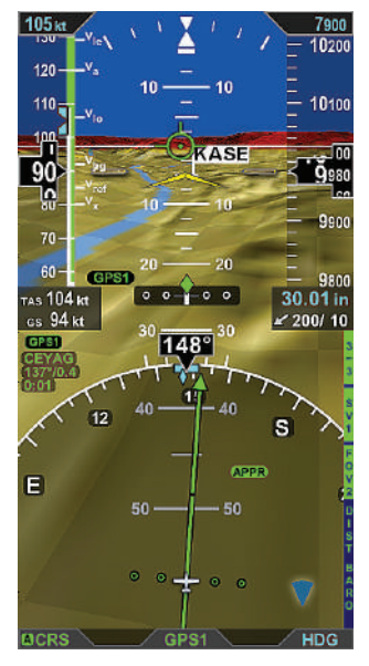
Pro PFD full screen, wide field of view