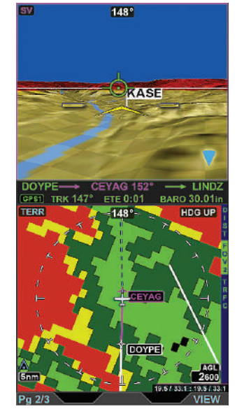
MFD Split Screen Layout — Evolution Synthetic Vision top, navigation and top-down terrain hazards bottom