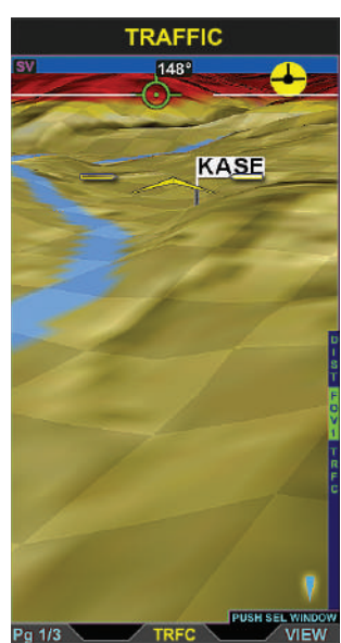
MFD Full Screen Layout — Evolution Synthetic Vision, narrow field of view, 3D traffic