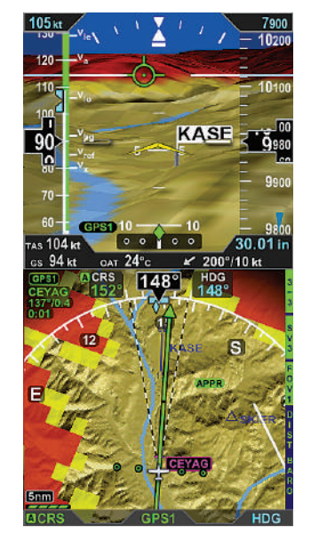
Pro PFD — Evolution Synthetic Vision top, terrain view with hazard overlay bottom