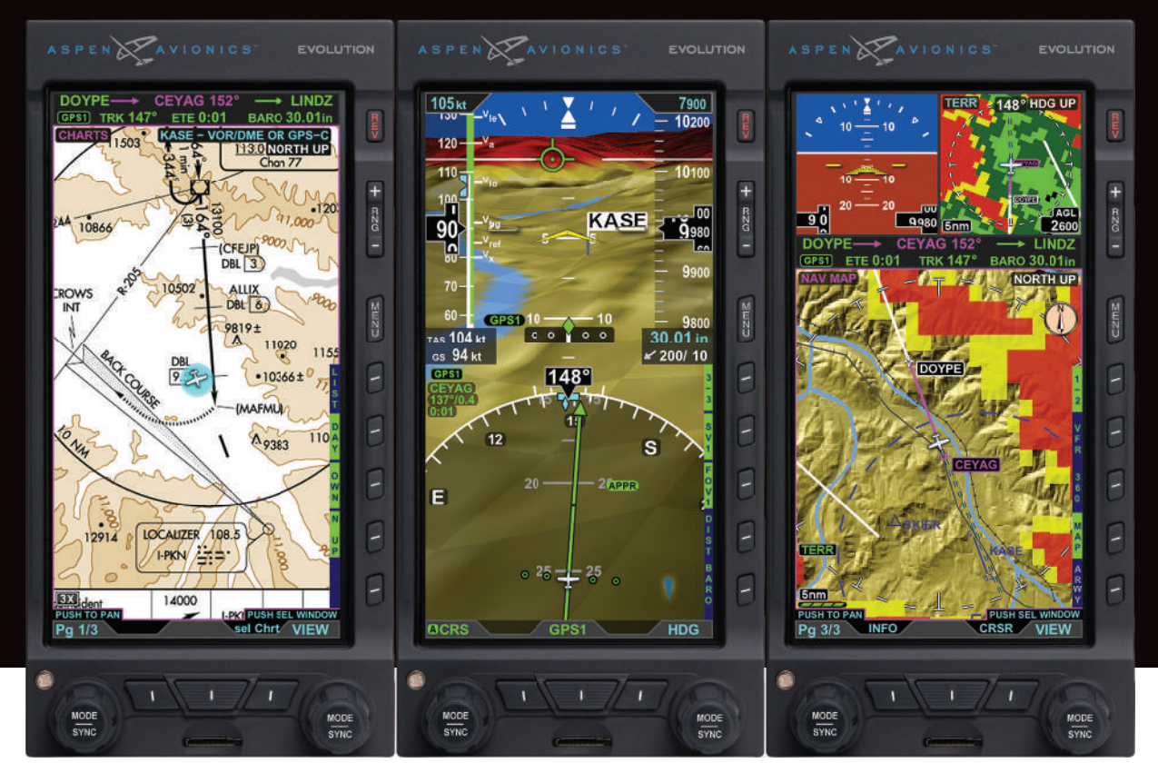
Evolution 2500 showing Evolution Synthetic Vision on center PFD