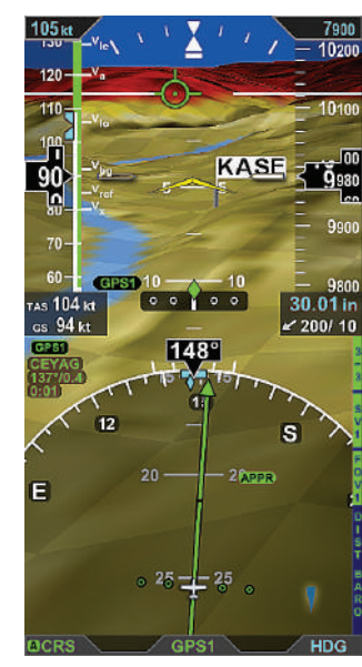
Pro PFD full screen, narrow field of view