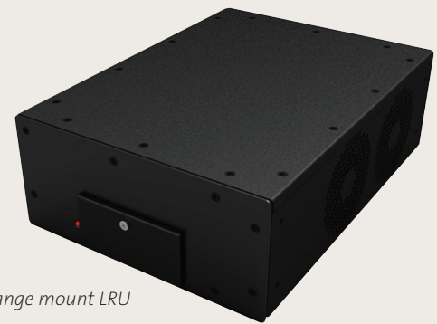
Flange mount LRU

Today, Airshow 500 delivers the first 3D moving map system designed and priced for the light business jet.