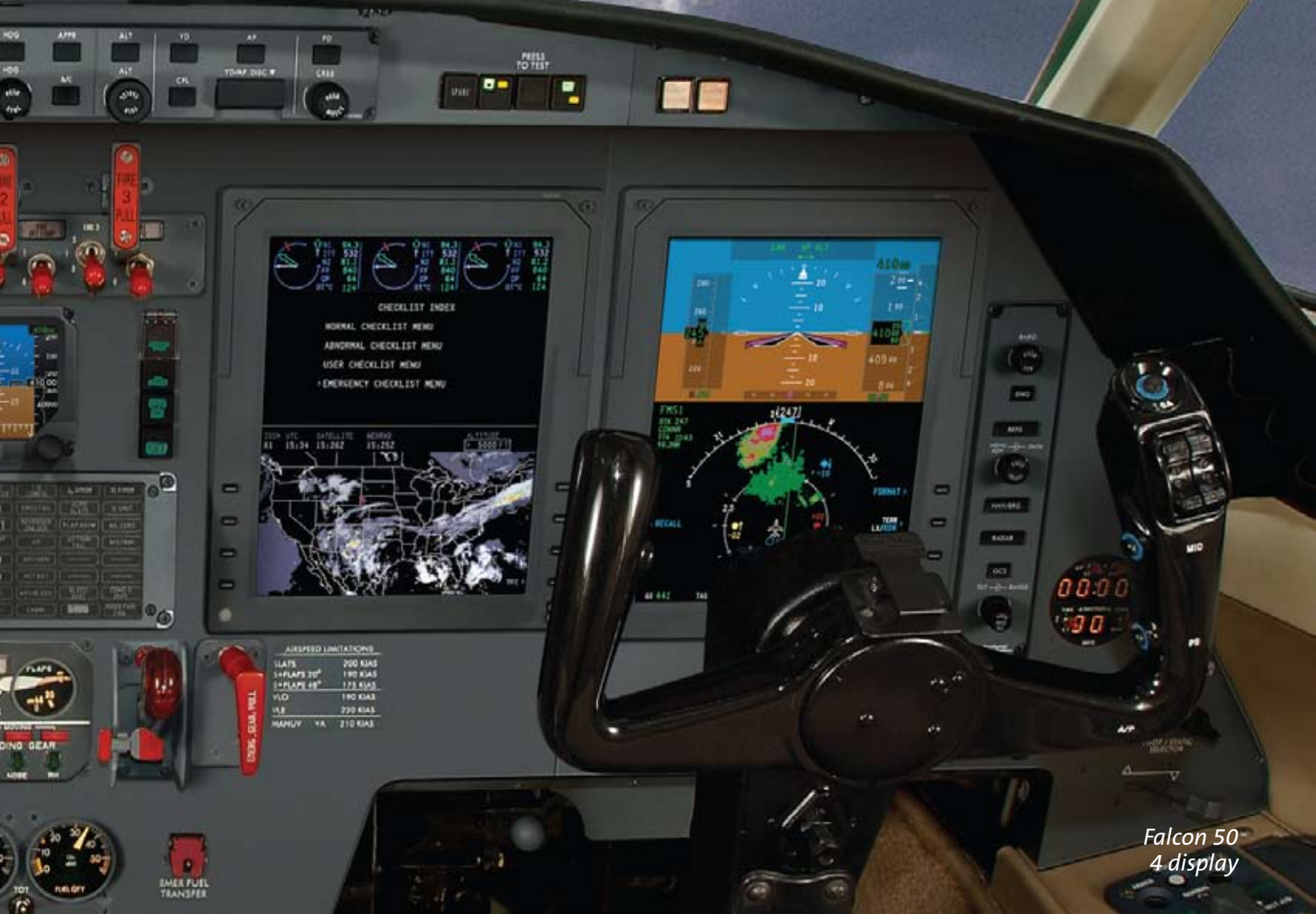
Falcon 50 4 display