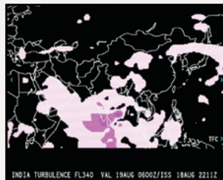
Turbulence display capability