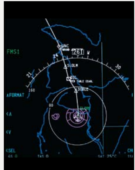
Controlled airspace information