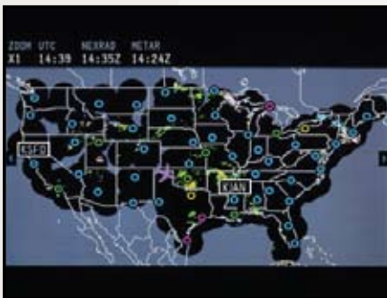
Graphical weather – U.S.