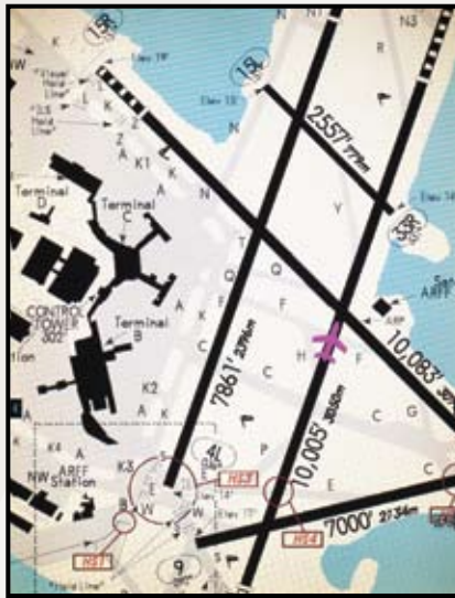
Know your position on the airport diagram