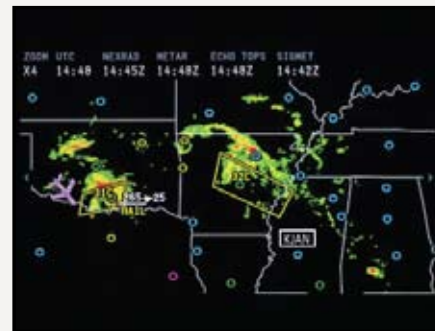
Graphical weather – regional