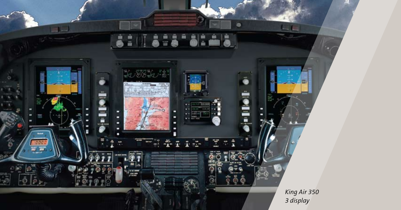
King Air 350 3 display