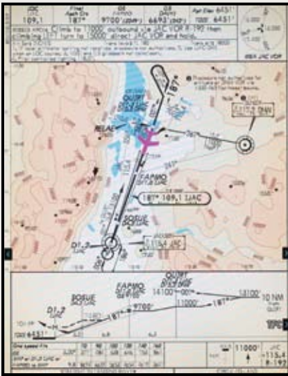
IFIS electronic charts

array of information presented in easy-to-read formats. No more searching multiple sources, navigation charts, graphical weather or even checklists – with IFIS it's all on the aircraft's MFD and it's all controlled through a logical, easy-to-use interface.