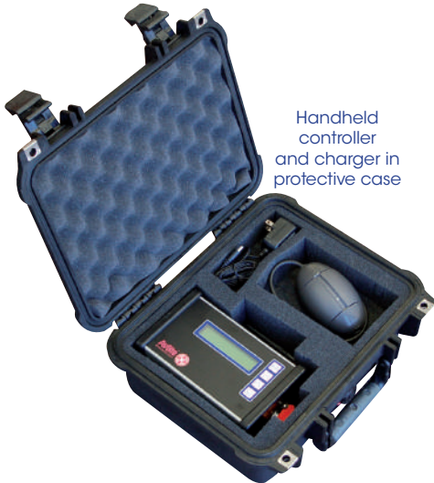
Handheld controller and charger in protective case