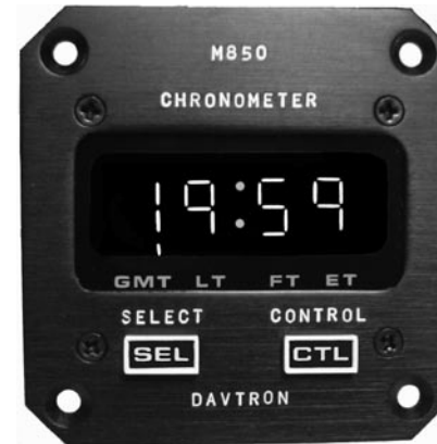
Greenwich Mean Time

Remote Time Display: Additional time displays can be driven by the M850 clock. Only two wires carry the time information to the remote display. The remote displays have independent automatic dimming. Either GMT or LT may be displayed. Remote display units are available from Davtron, Inc.