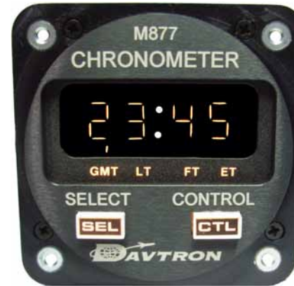
Greenwich Mean Time

Enhanced Mode: Remove case and jumper Opt-1.