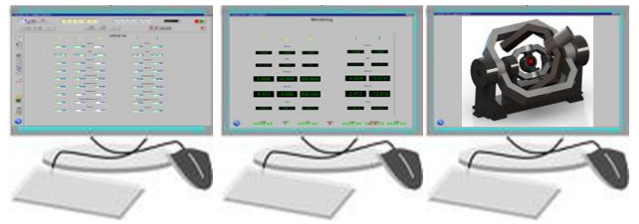
DYNAMIC MOTION SIMULATOR