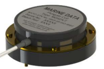
MD54 Compass Sensor Adhesive Mount (available separately) SKU F054001*