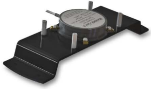
MD58 Compass Sensor Bracket Mount (available separately) SKU F058001*

*One sensor mount is a required option (available separately) - depending on the type of host magnetic compass; please contact Marine Data to obtain the correct mount